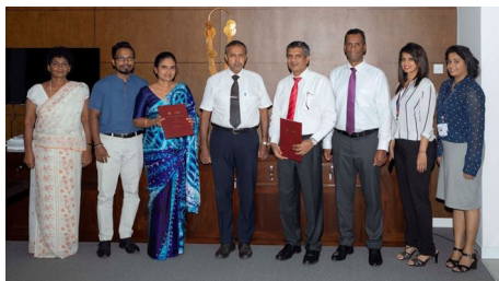
An MOU was signed with Teejay Lanka PLC (Pvt) Ltd