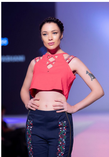
The 13 th Graduation Fashion Show of the Department of Textile & Clothing Technology was held on 13 th June 2019