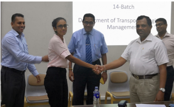
The final year students' research presentations of the