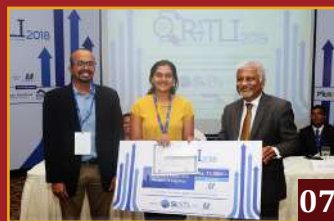
Best Undergraduate Research Paper