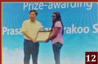
IEEE RO-MAN Conference