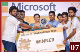
Win Hack: Bit 2018