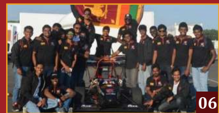
IMechE Formula Student (FSUK) 2018, UK